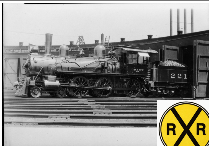
Atkins Historical Photo (above): This photo of the Atkins Roundhouse is estimated to have been taken around the 1920s. The photo came from the historical files of The Chicago-Milwaukee & St. Paul Railway located at the Milwaukee Public Library.

A property owner may request water service be suspended and water will be shut off at the curb. There is a fee associated with this service. No utility bill will be issued while service is suspended. The City will no longer pause billing without turning service off at your curb.