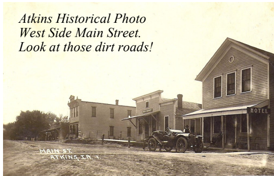
Atkins Historical Photo West Side Main Street. Look at those dirt roads!