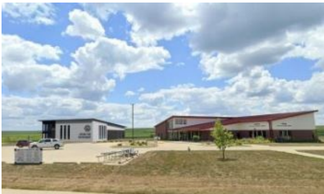
Shown above preliminary plans for future Atkins Fire Dept.

The original City Hall building was built in 1923 and still stands today. It is used by our Public Works Department. Located on 1st Street.